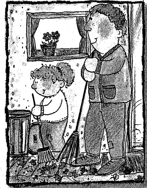
Clean up debris