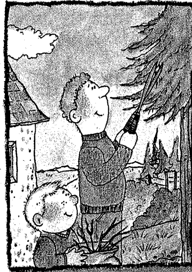
Prune trees regularly