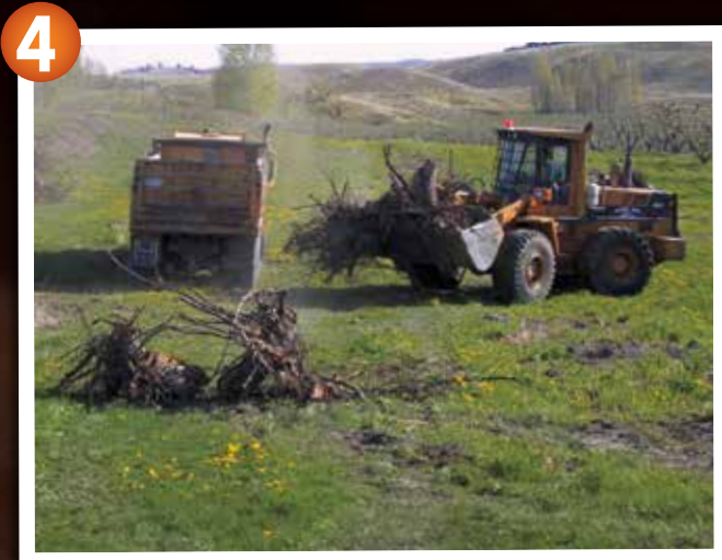
Step 4 Have an excavator or tractor create windrows of pulled Trees.