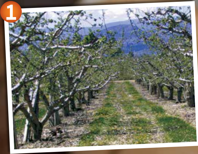
Step 1 Contact the program coordinator before pulling! Call 250 469-8408 and register for the free chipping program.