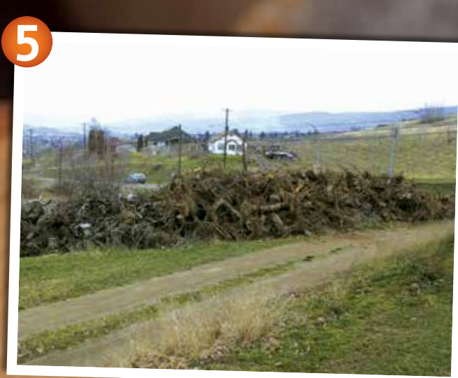
Step 5 Ensure the excavator makes one pile for every acre of trees pulled.