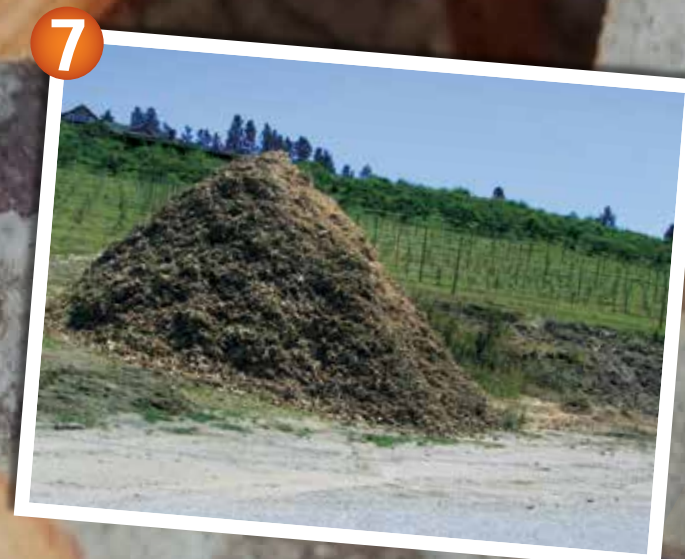
Step 7 Do not move or use wood chips until the program administrator surveys the pile!

PLEASE CALL THE PROGRAM COORDINATOR BEFORE YOU PULL! 250 469-8408