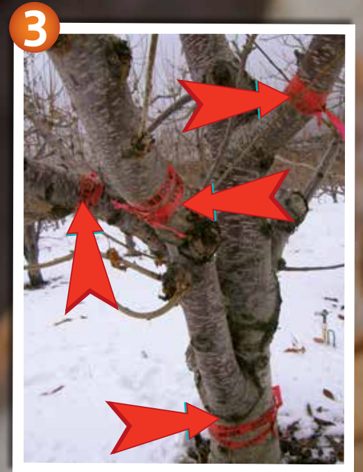
Step 3 Cut trees approximately two or three feet above the root ball. Large trees should be cut in half and de-limbed. Peel tree "like a banana". The Red arrows in the above image show where to properly de-limb your trees.