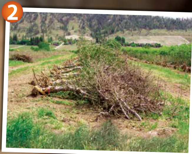
Step 2 Pull out unwanted orchard trees. Tree roots must be free of rocks and dirt. Failure to remove rocks and dirt will result in additional fees or refusal of chipping.